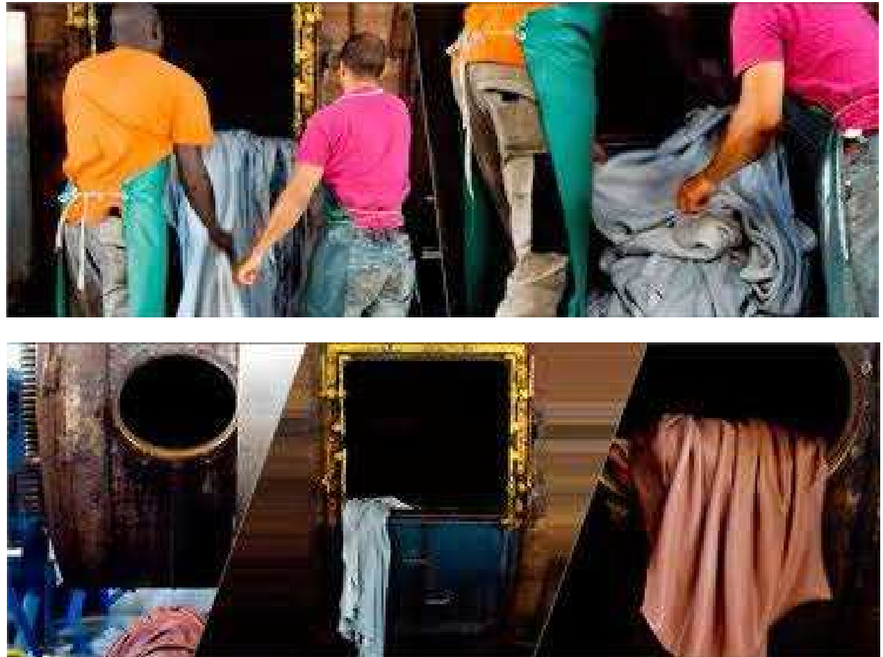
Tanning and retanning in barrels

The final operation in the tanning process of leather for furniture consists of finishing, which is the sum of all the operations performed on the leather to improve the aspect and make the color vivid, uniform, brilliant and/or opaque and eliminate any possible defects.