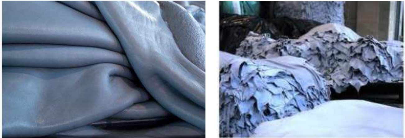
Leather tanned with chromium salts "wet-blue" and "crust".

Leather for furniture is much suppler than traditional leather and is obtained by chrome tanning ; usually it is much faster, only 4 days, than vegetable tanning. The blue skins derived from this type of tanning are known in jargon as " wet-blue " if wet or " crust " if dry.