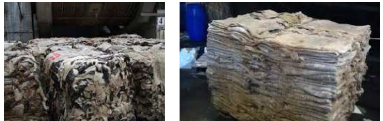
Rawhides ready for the first tanning operation

Leather for furniture is obtained from bovine hides or skins through tanning that transforms it into a very durable material.